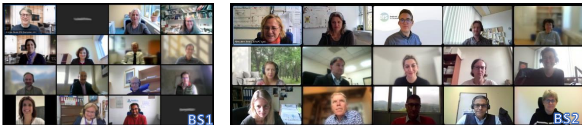
Fig. 2: Breakout session 1 and 2 of Topical Online Meeting 2023

main meeting, where stakeholders were informed about activities in PIANOFORTE including the feedback on results and outcome from the previous TOM in 2022, two breakout sessions (BS) dealing with specific topics from the shortlist were offered to the participants (Fig.2). As part of this stakeholder consultation process, the participants were invited to provide written comments and a ranking of the topics from the shortlist after the meeting. The feedback from the meeting/sessions is analysed and will feed into the process of finalising the topics for the 2 nd Call in 2024.